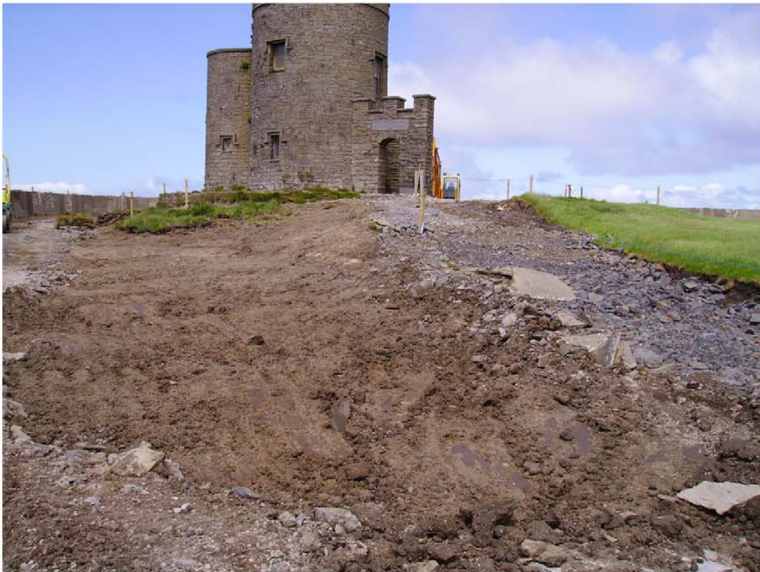
Plate 4: Topsoil stripped adjacent to tower. Looking east