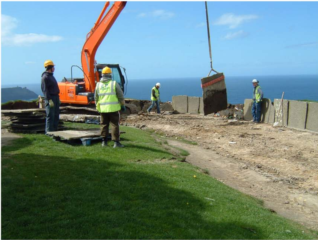
Plate 3: Slab removal by tower. Looking north-west