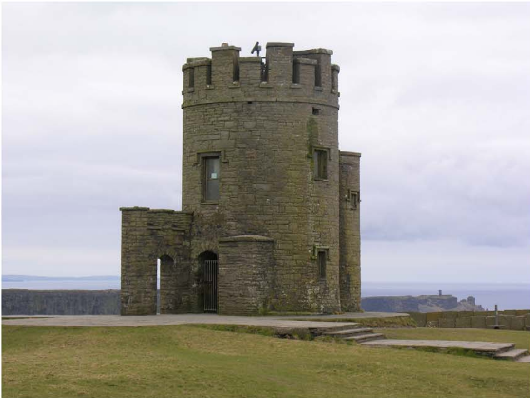
Plate 2. O'Brien's Tower. Looking south