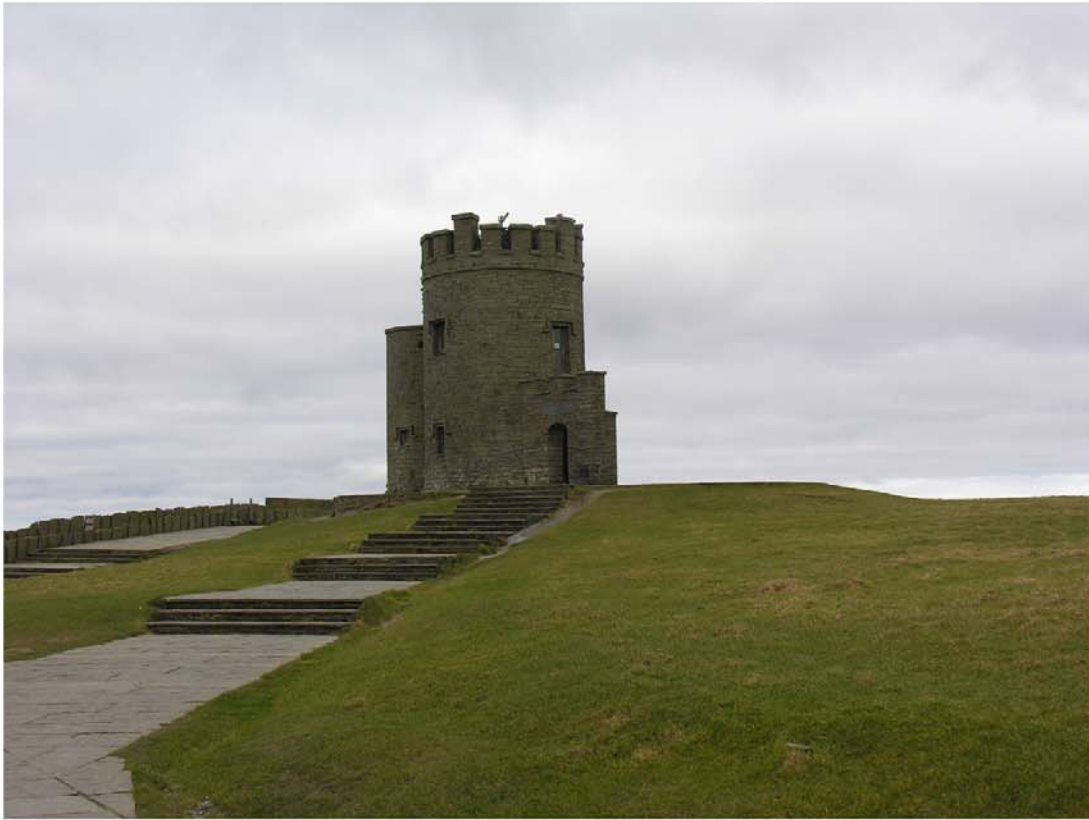
Plate 1: O'Brien's Tower, showing earthwork CL014-002. Looking north