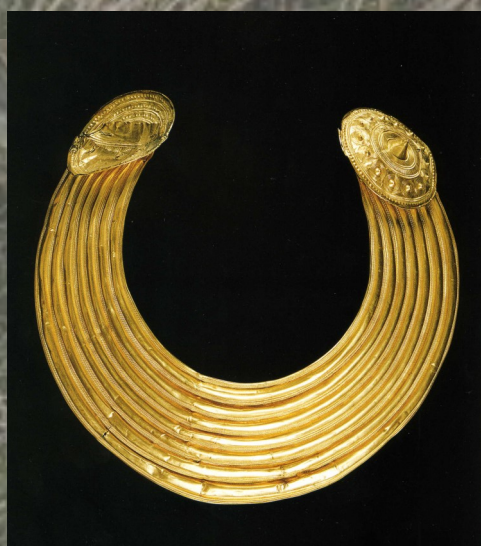
Ardcrony Gorget