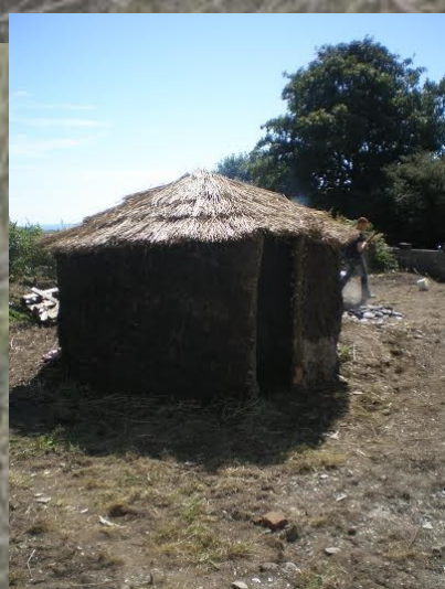
A reconstructed steamhouse

You can find the 'Department of Archaeology, NUI Galway' on the web @ www.nuigalway.ie/archaeology